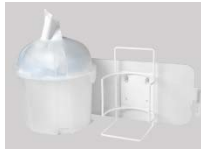
Accessories plate with Hygienic Covers dispenser and disinfecting wipe receptacle holder