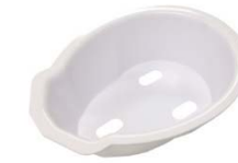
Pail with holes