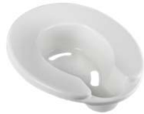
Hy21® Bedpan Seat with holes