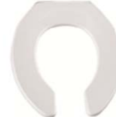
Round Open Front Seat without cover