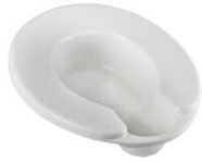
Hy21® Bedpan Seat with full bottom