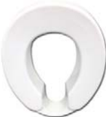
Hy21® Bedpan Seat bottomless