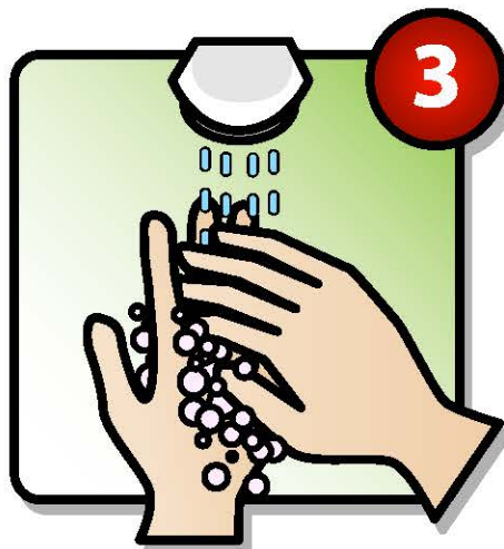
Generate a heavy lather and wash well for approx. 15 seconds. Clean between fingers, nail beds, under fingernails and backs of hands