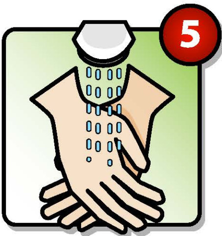
Hold hands so that water flows from the wrist to fingertips.