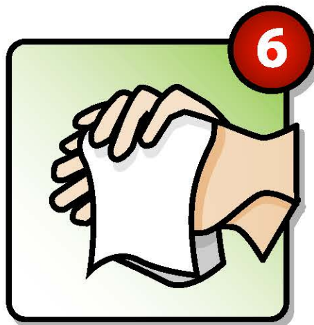
Dry hands completely with clean paper towels.