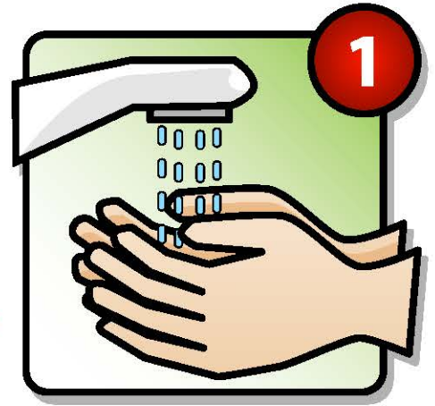
Turn on water to a comfortable temperature and moisten hands and wrists.