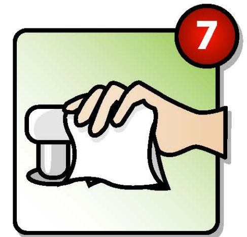
Use the paper towel to turn off the faucet so your hands remain clean.